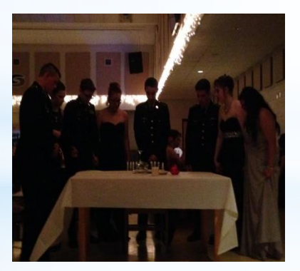
POW MIA Table at Military Ball.