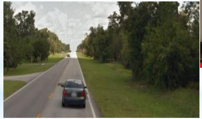
The cadets maintain Pleasant Grove Road in Inverness.