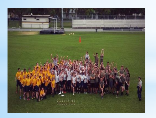
Cadets at the local field day competition.