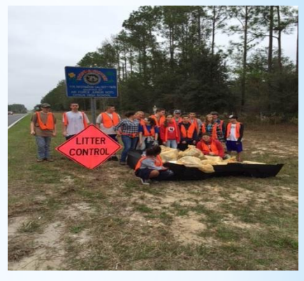
Highway clean upon pleasant grove road.