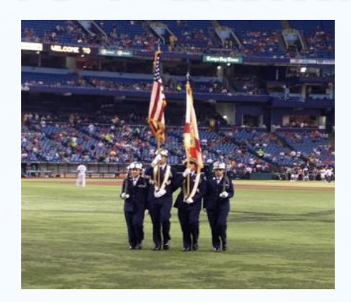
Presentation of Colors at the Rays Game.