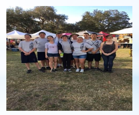
The 2016 strawberry festival.